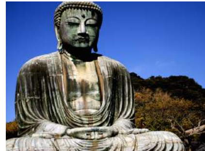
Great Buddha of Kamakura