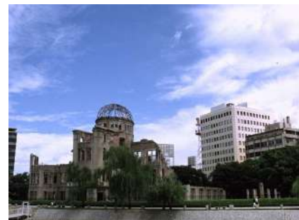
Hiroshima Peace Memorial