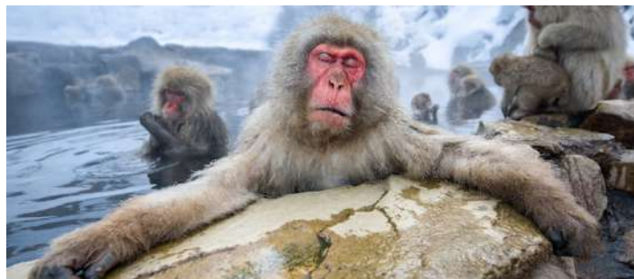
Jigokudani Monkey Park