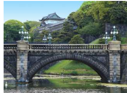
Tokyo Imperial Palace