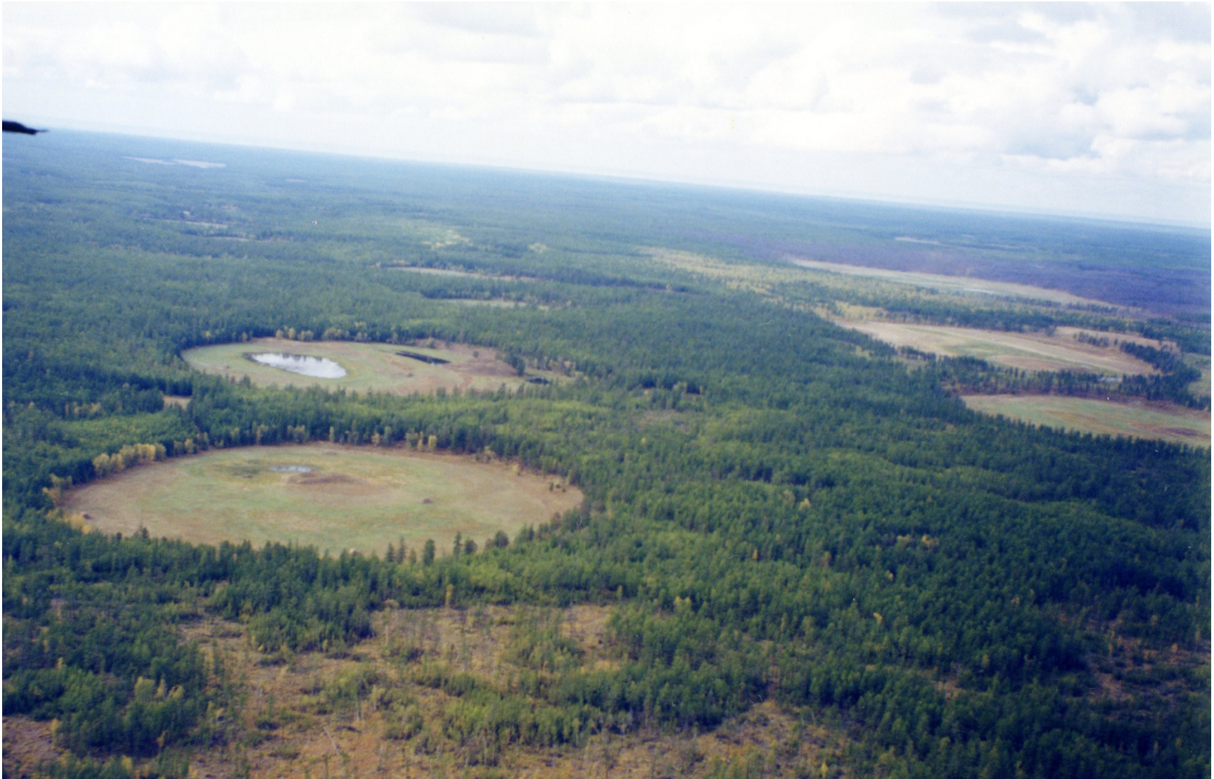
Fig. 4. Habitat of Siberian salamander in alas-taiga region