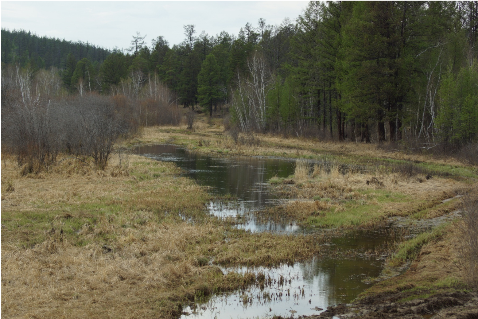
Fig. 5. Shallow pond in the basin of shallow-valley river Ulakhan-Aan what is typical habitat for Siberian Salamander