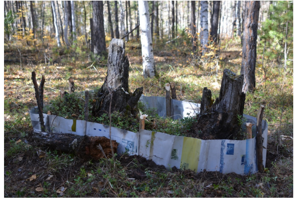
Fig. 6. Wintering station of Salamandrella keyserlingii .

Left: 16 September, 2013. Siberian Salamanders prepared for winter where revealed under these rotten stump in 70 meters from the lake