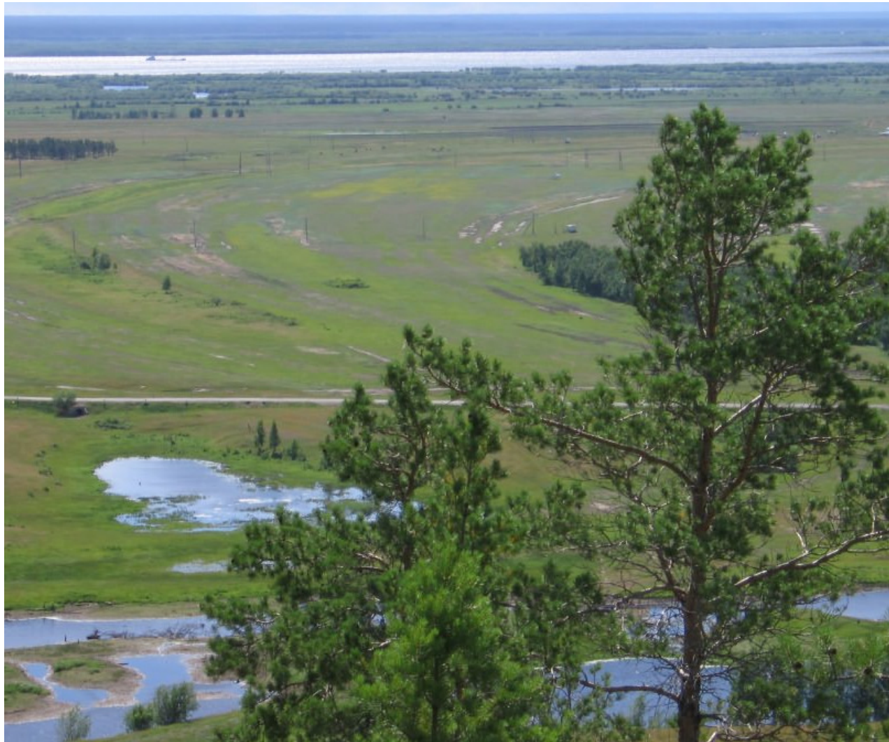
Fig. 3. Typical habitat of Siberian salamander in Lena River valley