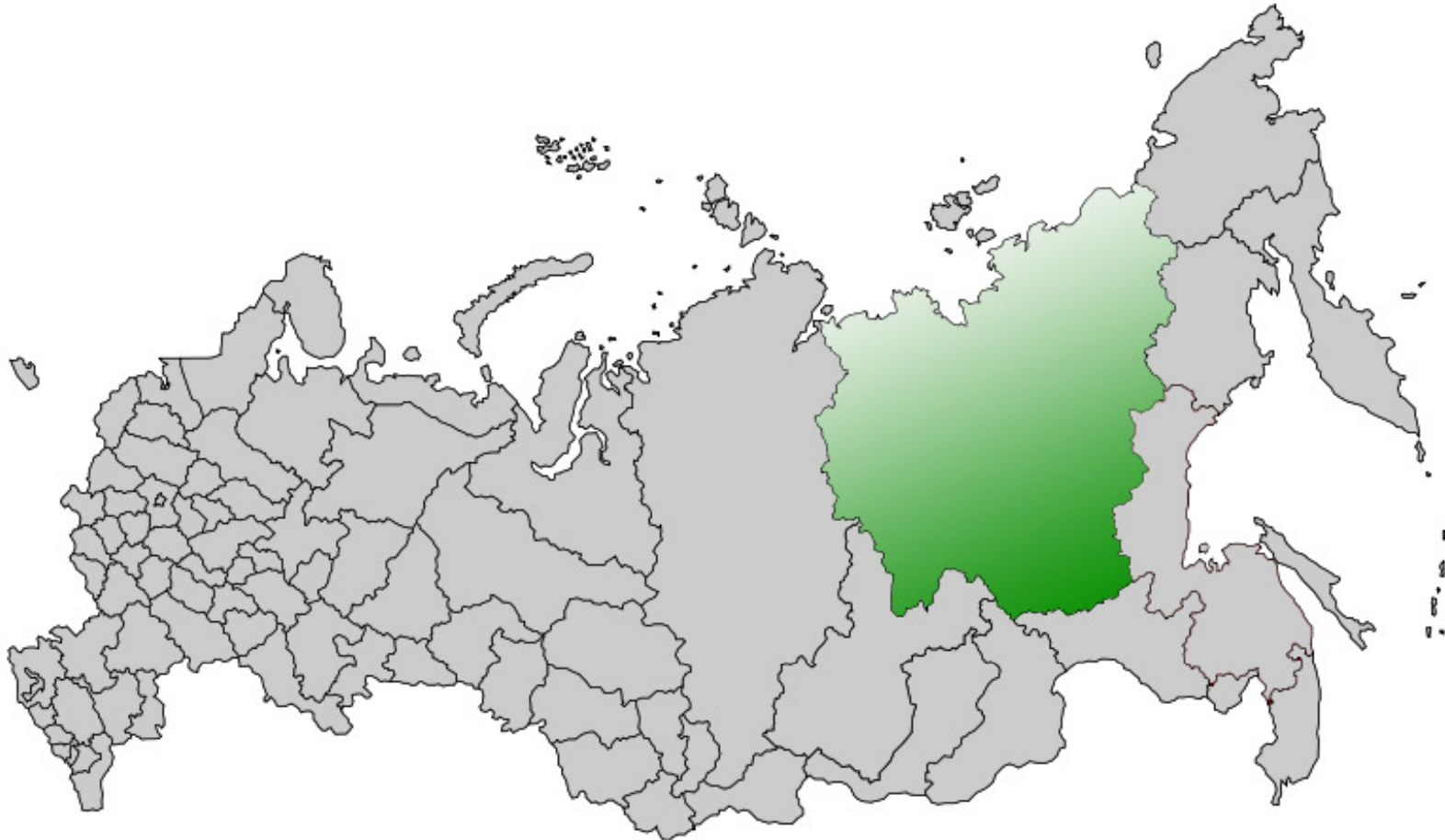
Fig.1. Republic Sakha (Yakutia) – the most great subject of Russia