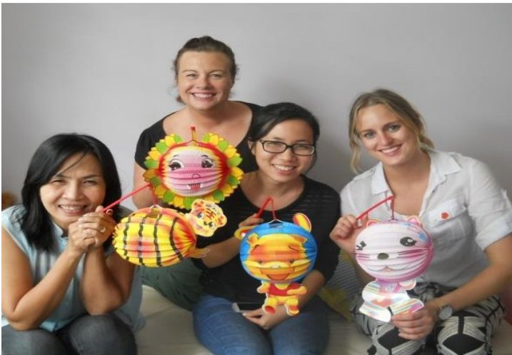
Celebrating Vietnam's National Day in the clinic 2014