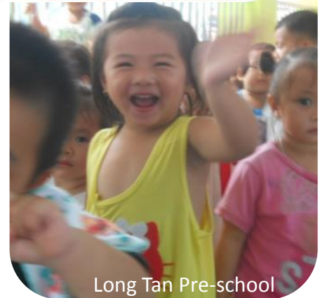
Long Tan Pre-school