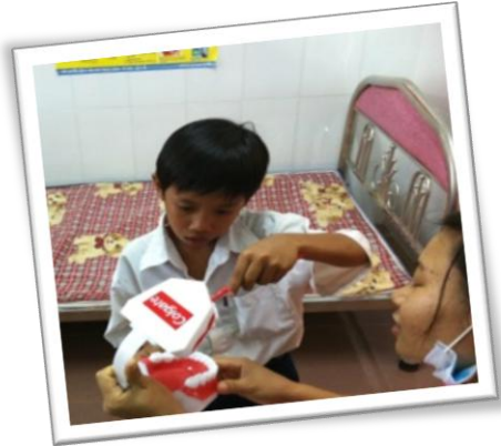
Dental health education in Long Tan Primary School 2011