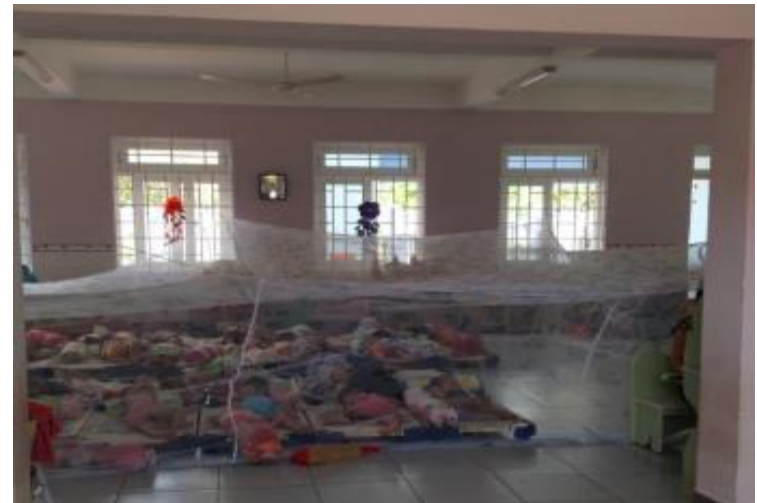
Long Tan pre-schoolers rest from 10.30- 1pm and then have their lunch until 2pm. Clinic does not operate between these hours.