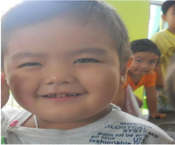
The project objective is to provide preventive services to school children in Long Tan