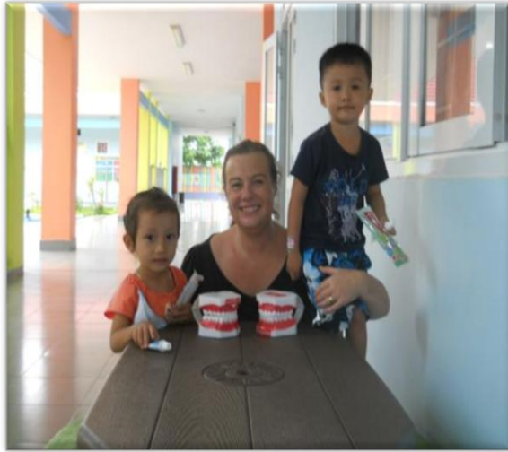
Long Tan Dental Project Vietnam Project established in 2007

www.fdiworldental.org/media/.../Guidelines-for-dental-volunteers-2005.