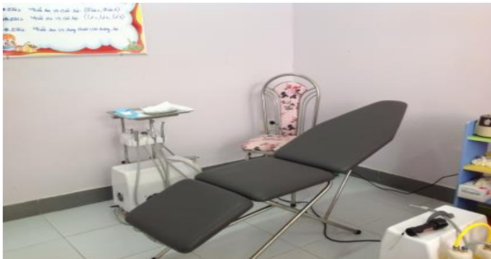
Australian dental hygienists' society donates a percentage of proceeds from CPD events annually to the Long Tan fund to purchase mobile equipment for the project in Vietnam