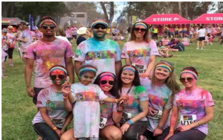
Colour Run 2015, ACT Dental practice raises money for children's heart disease

As oral health professionals we have a broad responsibility to the community in which we choose to practice and assist our communities with health issues and donate our time and or services to improve the health of the community.