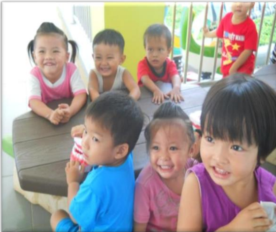
2-3 years olds waiting for dental screening Long Tan Kindergarten 2014