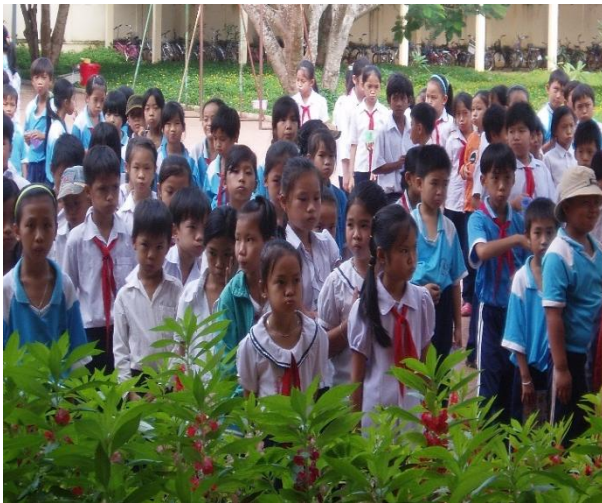
The local government actively support the Fluoride Rinsing Program at Long Tan Primary School