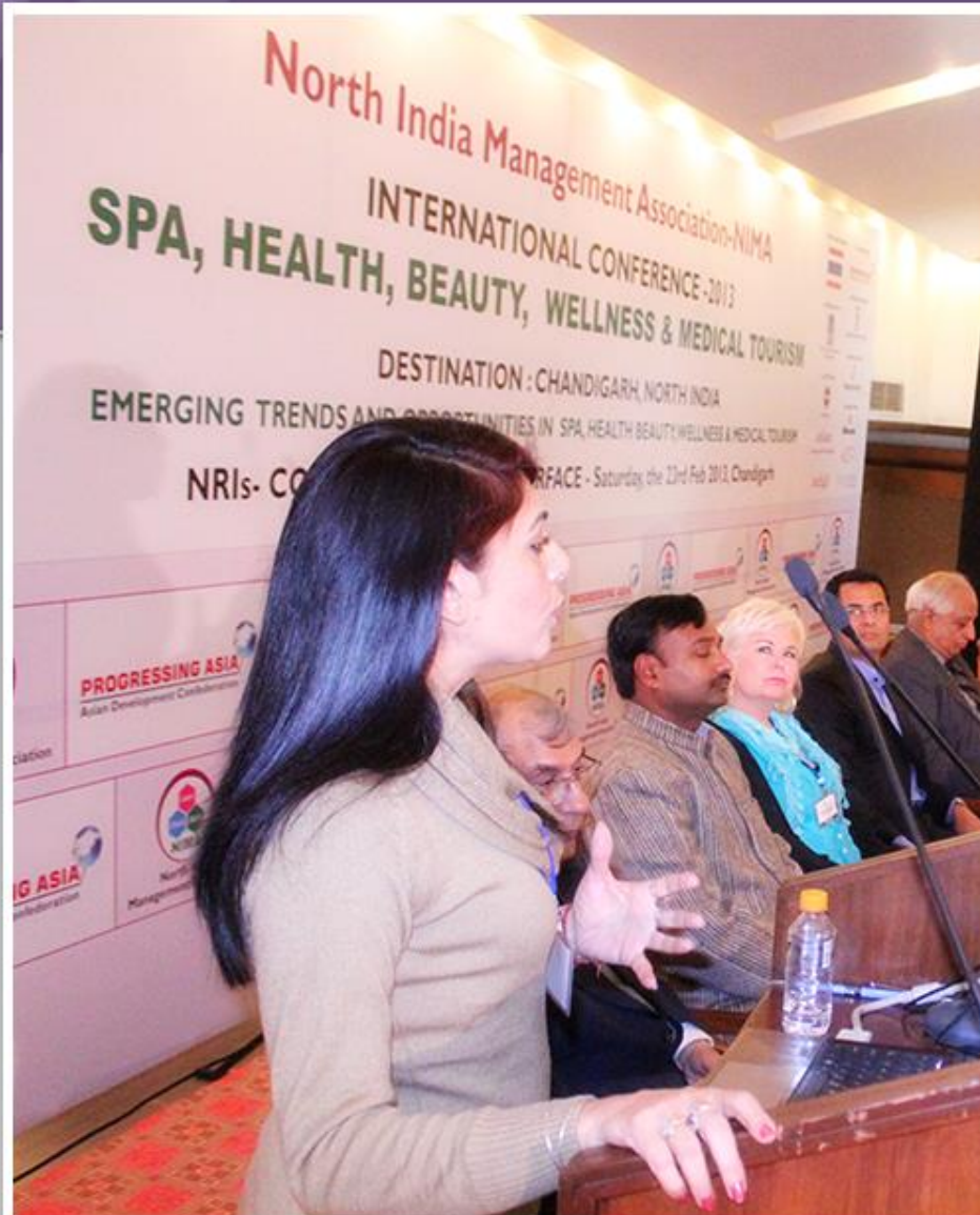
Speaker at International Conference on Health and Medical Tourism 2014