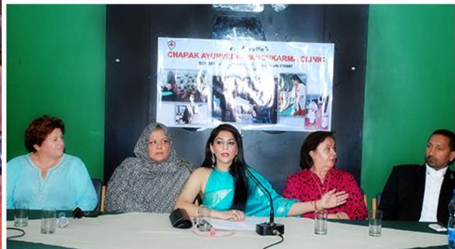
Press Conference on MEDICAL TOURISM WITH HER PATIENT FROM ABROAD