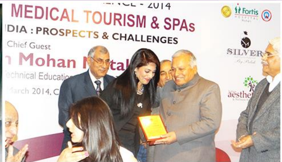
Awarded at International Conference on Health and Medical Tourism 2014