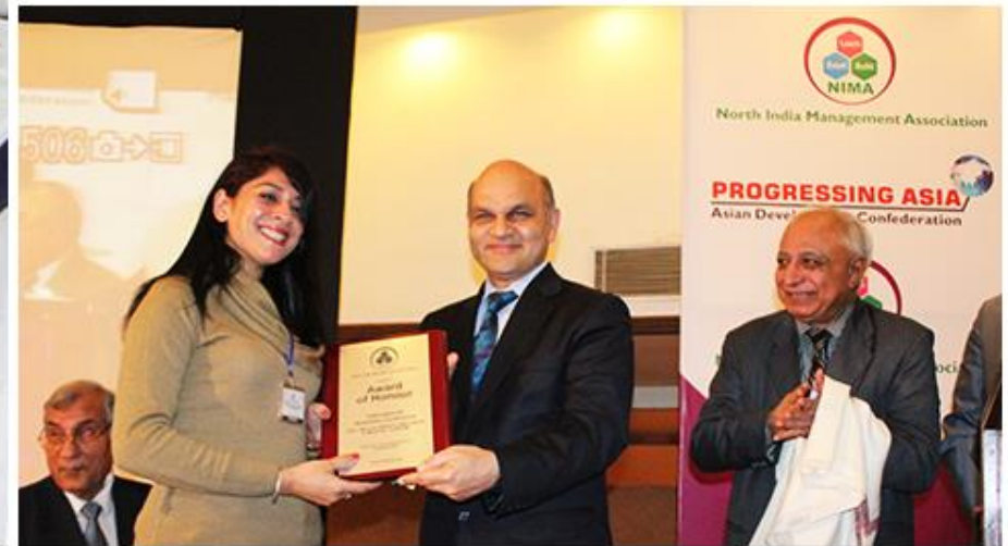
Awarded at International Conference on Health and Medical Tourism 2013