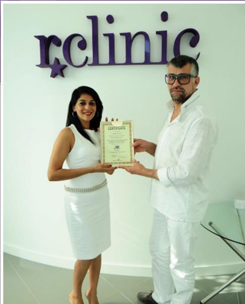
Honored in Poland for Aesthetics