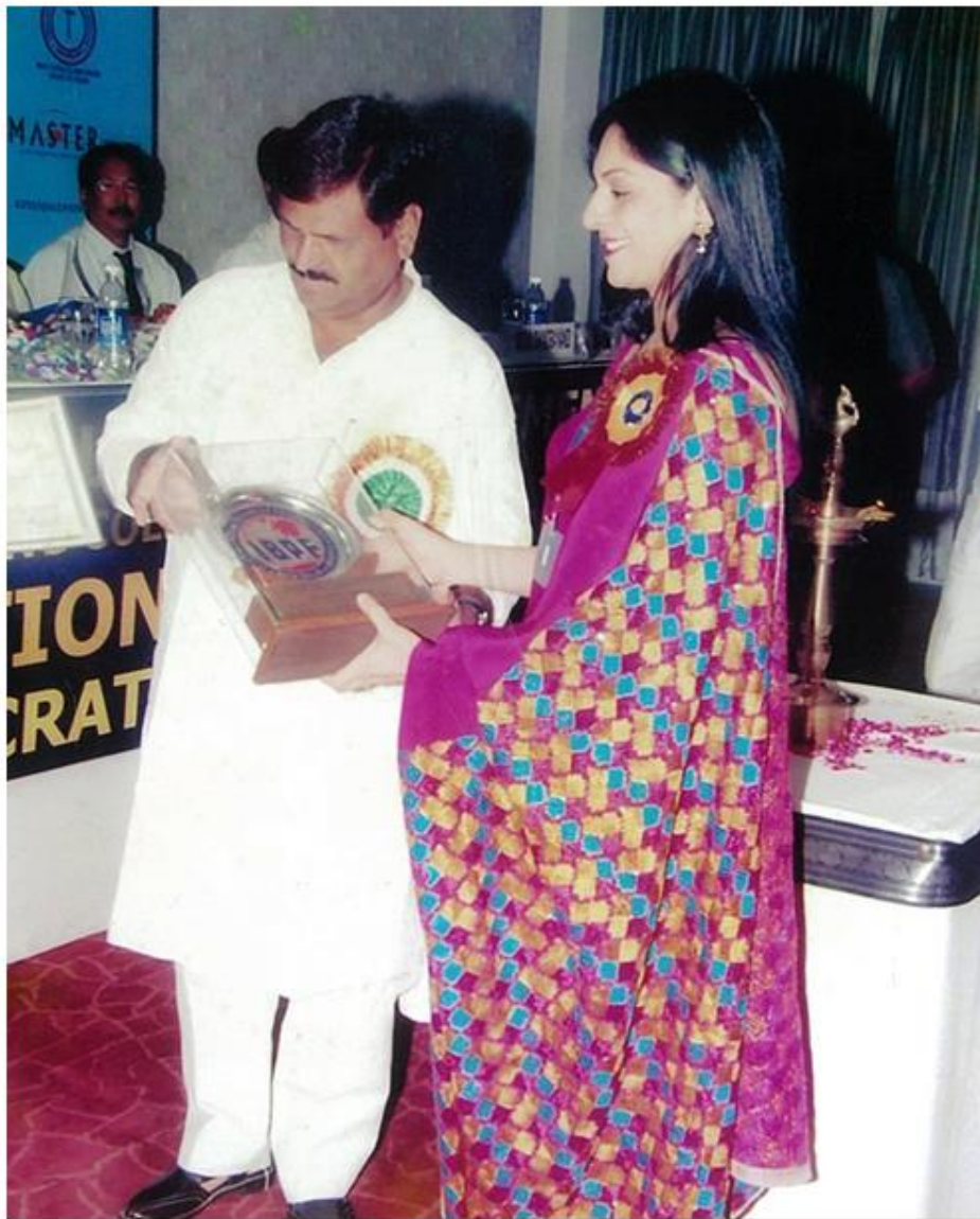
BESTOWED with INTERNATIONAL HEALTH CARE EXCELLENCE AWARD