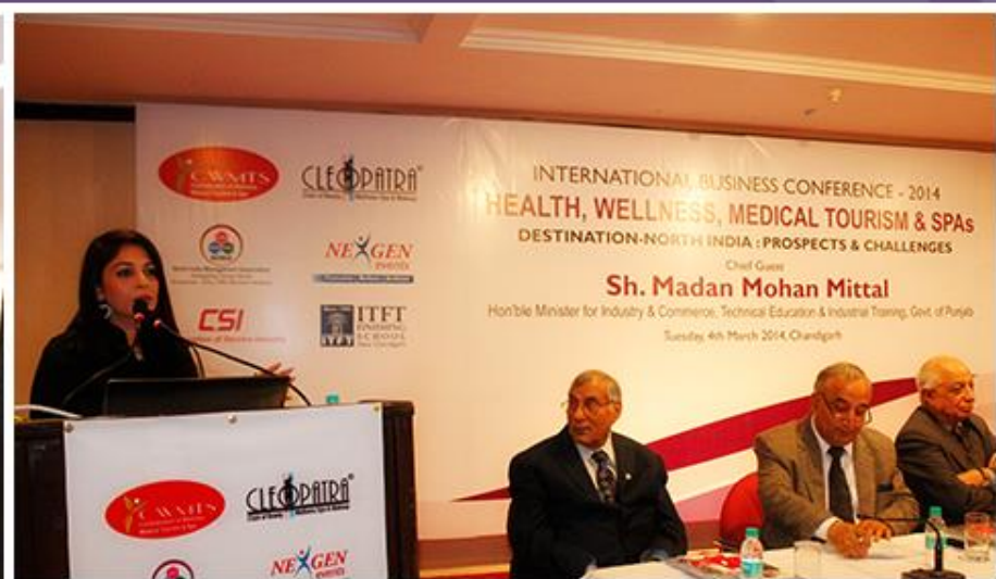
Speaker at International Conference on Health and Medical Tourism 2013