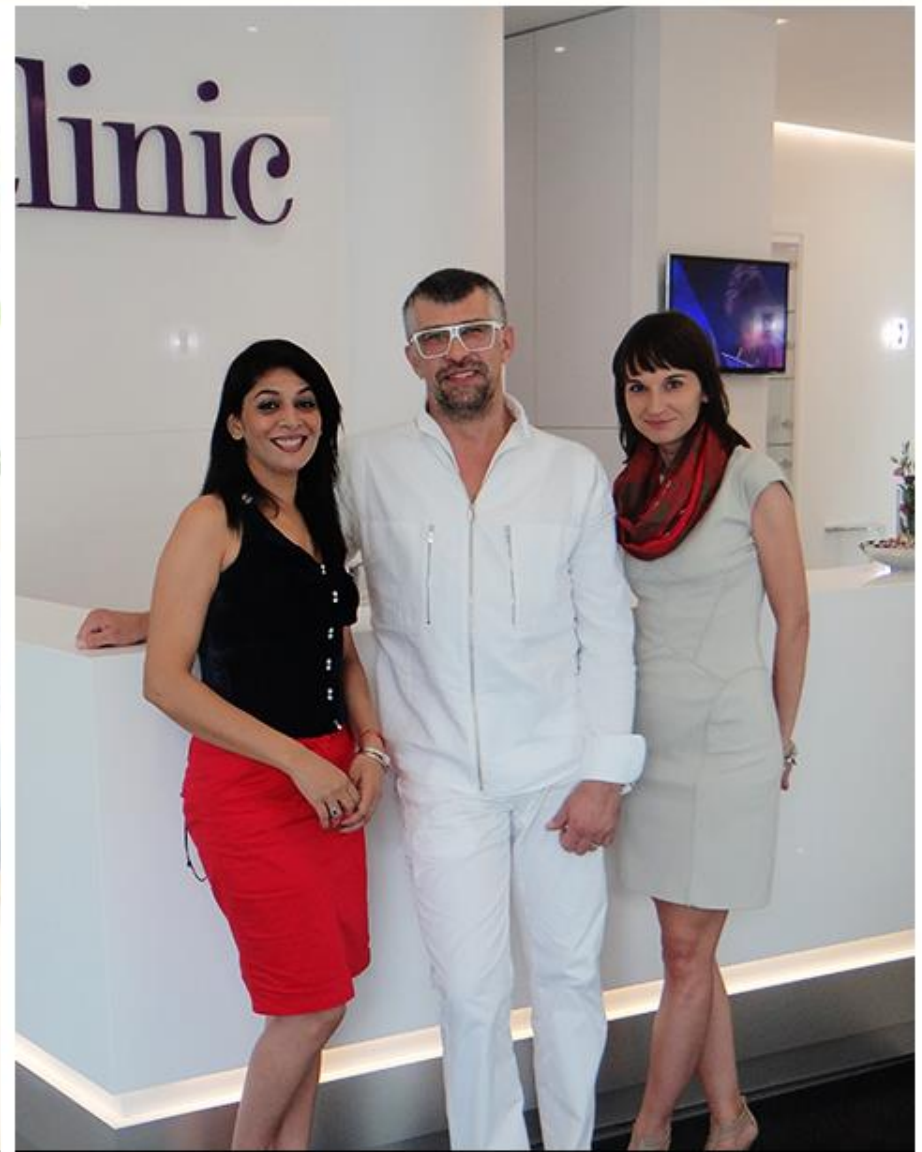
Honored in Poland for Aesthetics