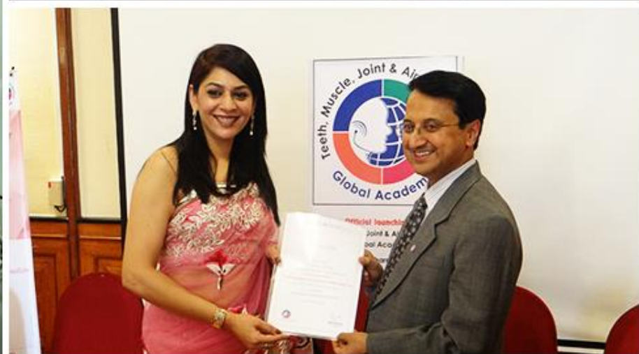
Honored at Sleep Apnea Conference in Nepal