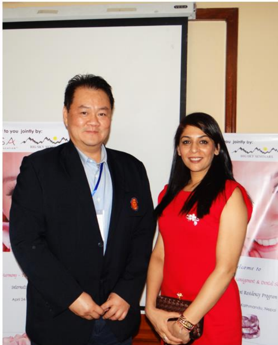
Honored at Sleep Apnea Conference in Nepal