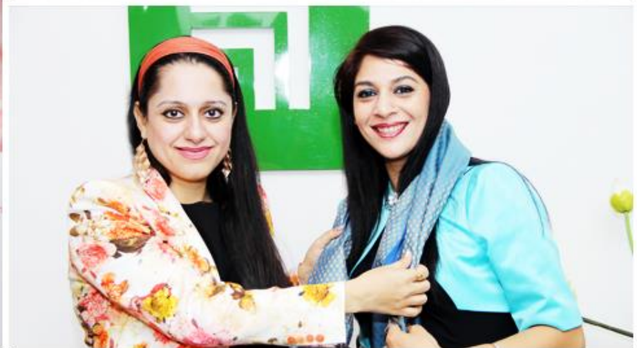
Honored for School Health Programs