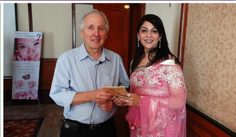
Honored at Sleep Apnea Conference in Nepal