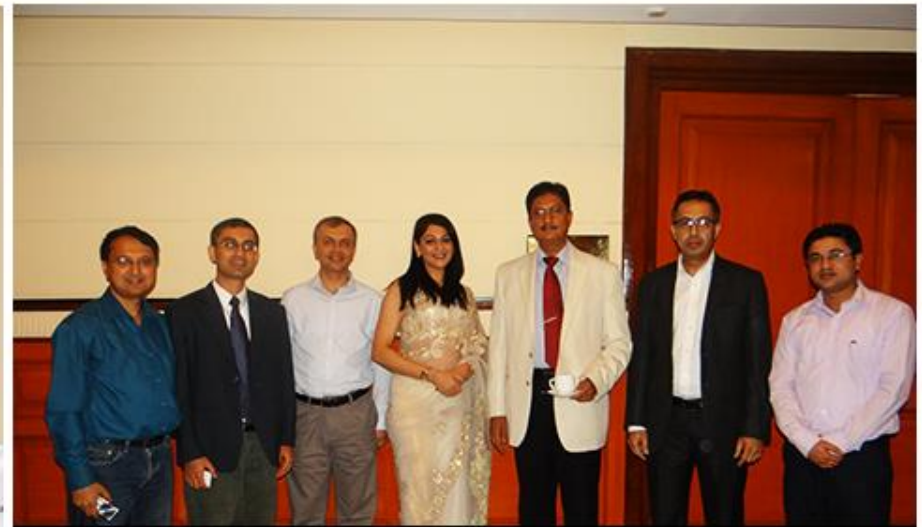
Honored at Sleep Apnea Conference in Nepal