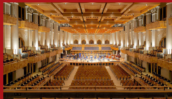
Grand Concert Performance Venue