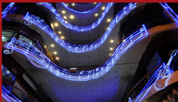
Galeria Do Rock