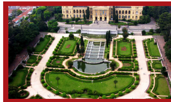
Independence Park Ipiranga