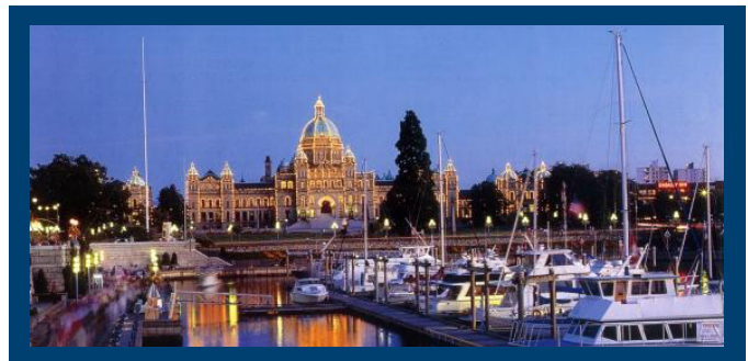
Victorias Inner Harbour