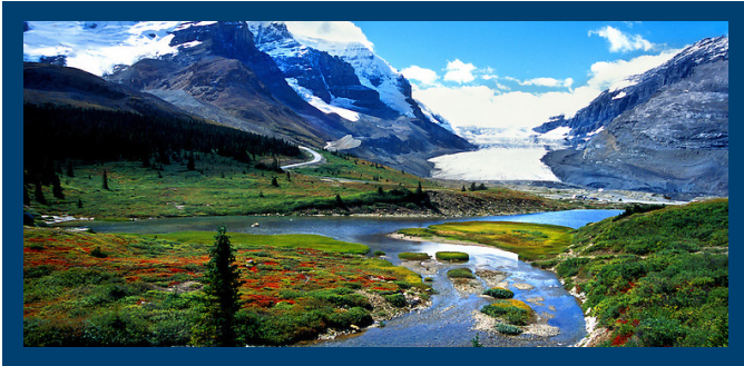
Jasper national Park