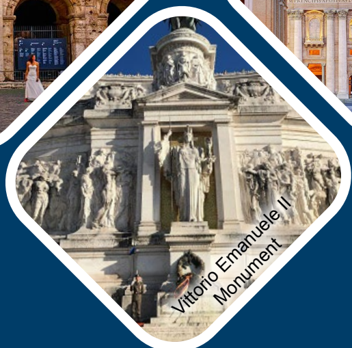
Vittorio Emanuele II Monument