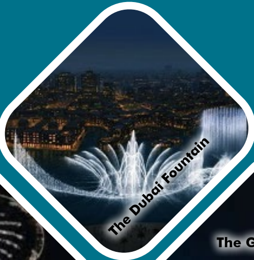
The Dubai Fountain