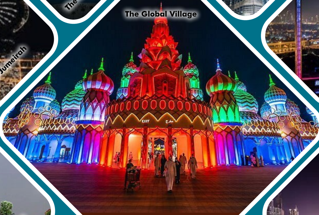
The Global Village