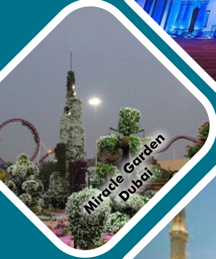
Miracle Garden Dubai