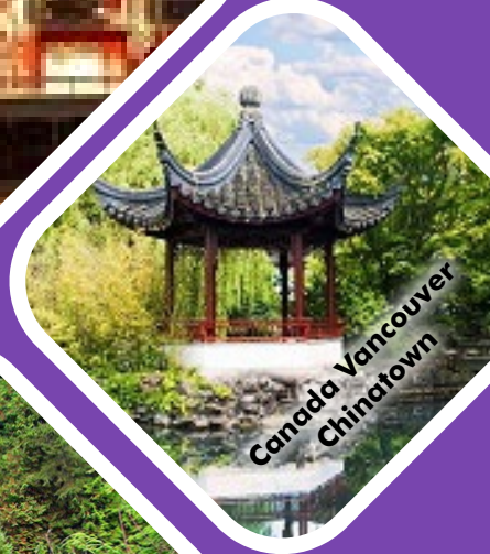
Canada Vancouver Chinatown