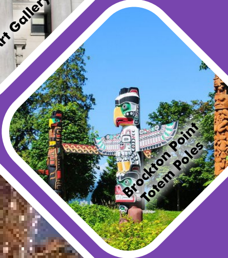
Brockton Point Totem Poles