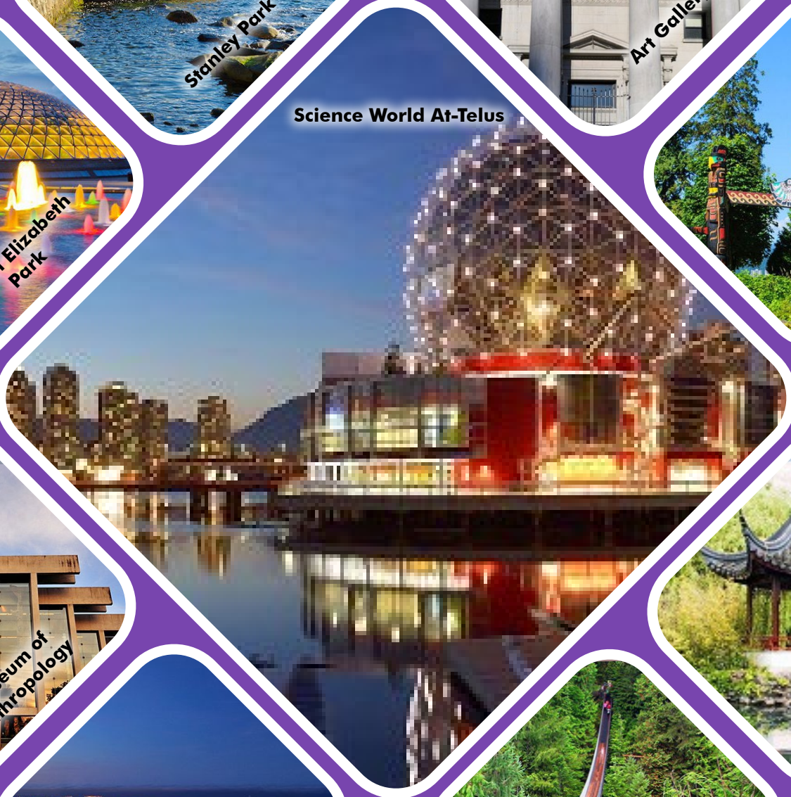
Science World At-Telus