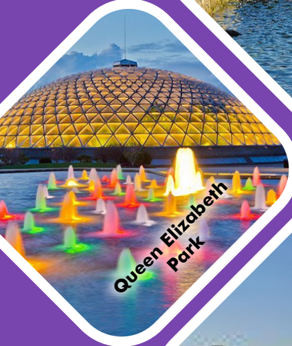
Queen Elizabeth Park