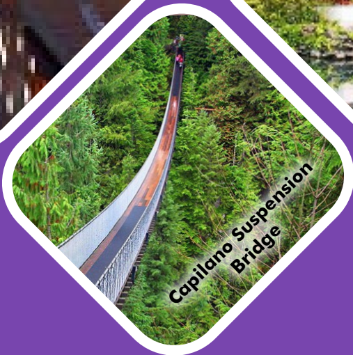
Capilano Suspension Bridge