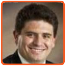
Espinosa PS | International Centre for Neuroscience, USA