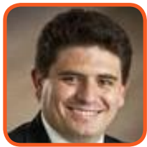
Espinosa PS | International Centre for Neuroscience, USA