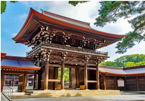
The Meiji Shrine