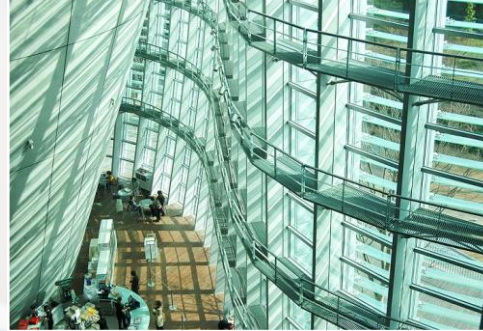
National Art Center