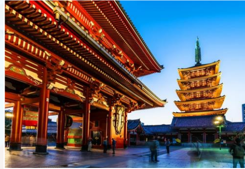
The Sensō-ji Temple