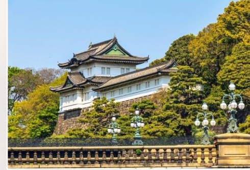
The Imperial Palace