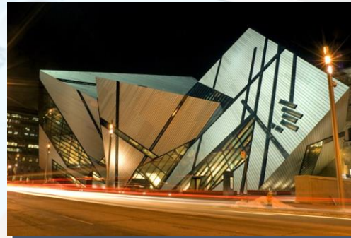
Royal Ontario Museum