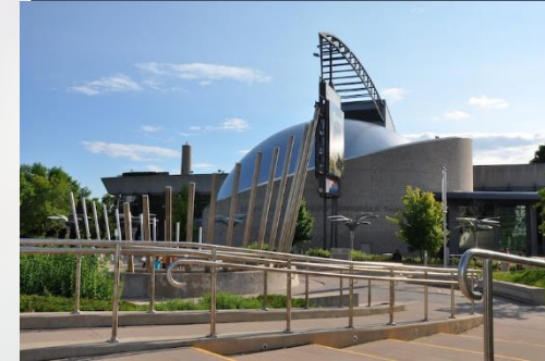
Ontario Science Centre