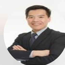
Chi-Tai-Yeh Taipei Medical University-Shuang Ho Hospital Taiwan