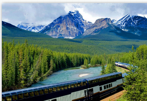
Rocky Mountaineer Rail Journey