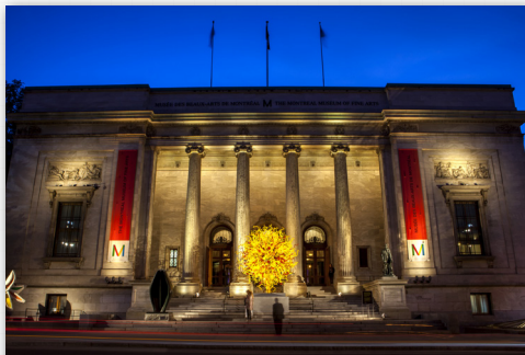
Montreal Museum of Fine Arts