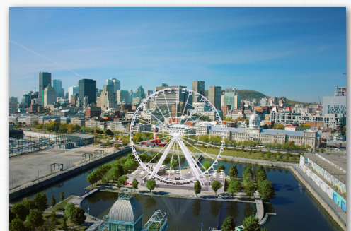
The Great Wheel of Montreal