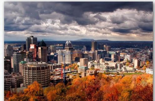
Montreal Sight Seeing Montroyal