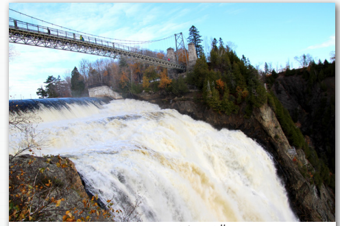
Montmorency Water Falls