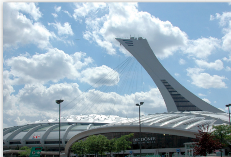
Montreal Biodome Olympic Park