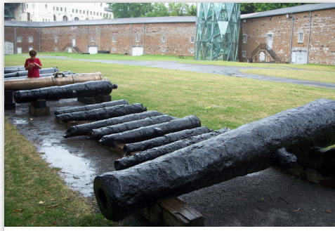
Citadelle of Quebec Royal Museum