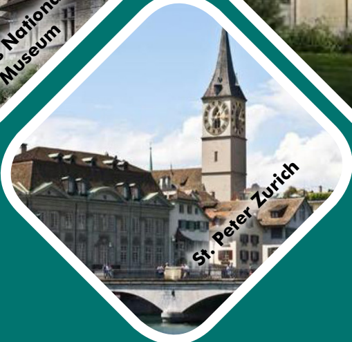
St. Peter Zurich