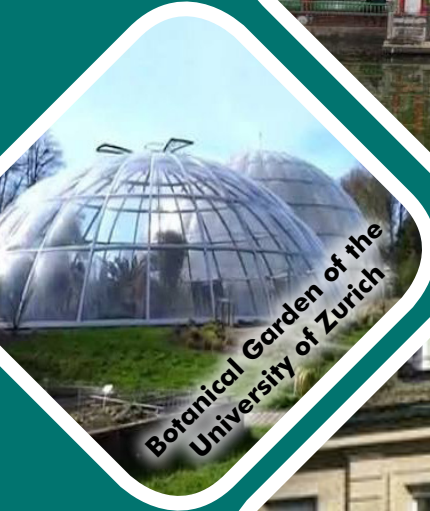
Botanical Garden of the University of Zurich