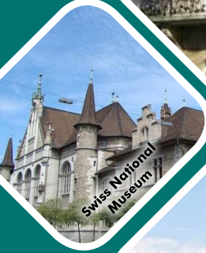
Swiss National Museum