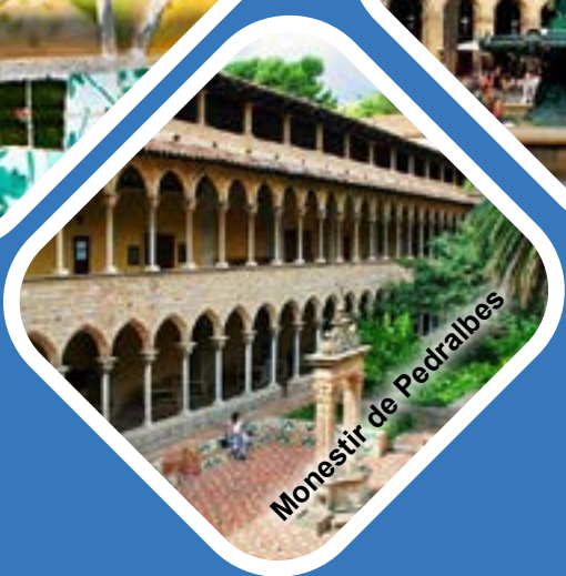
Monestir de Pedralbes