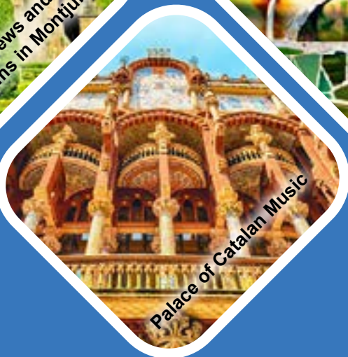
Palace of Catalan Music