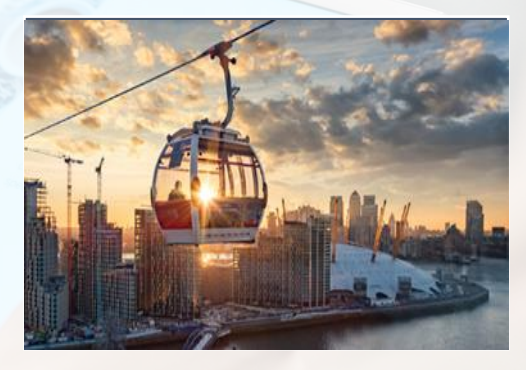
Emirates Air Line cable car