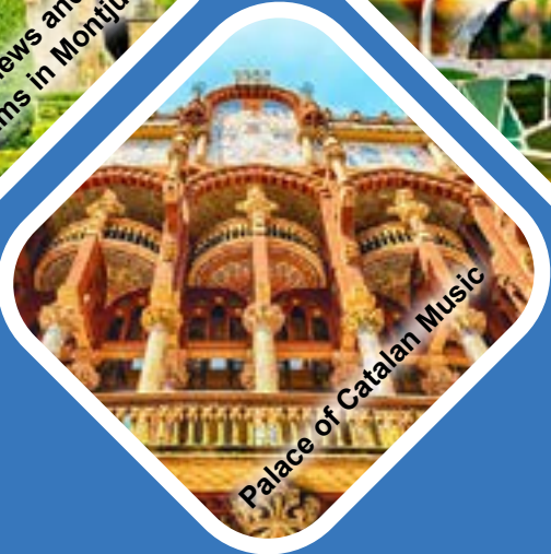
Palace of Catalan Music