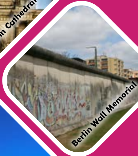
Berlin Wall Memorial