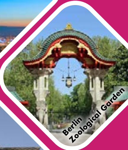
Berlin Zoological Garden