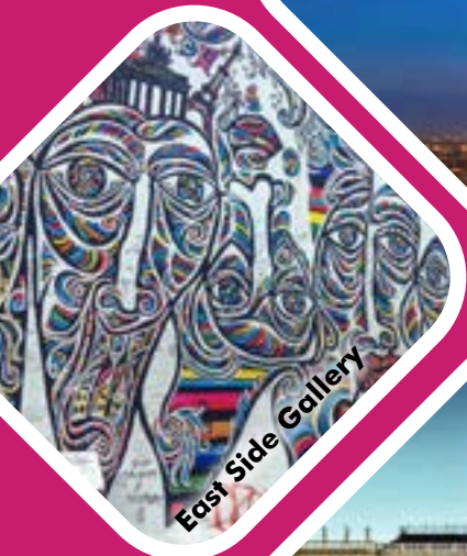
East Side Gallery