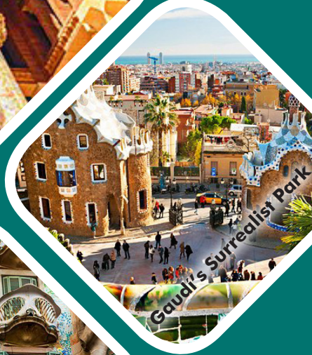
Gaudí's Surrealist Park