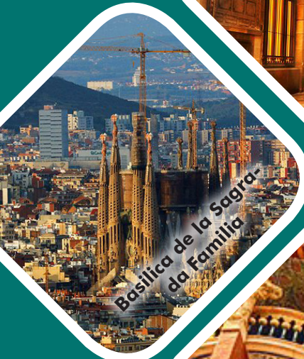
Basilica de la Sagrada Família