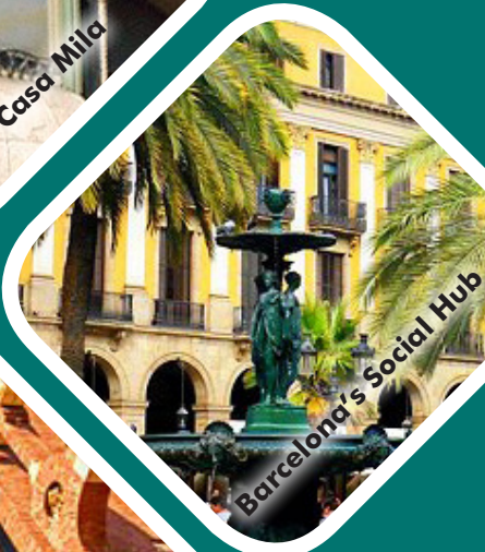
Barcelona's Social Hub