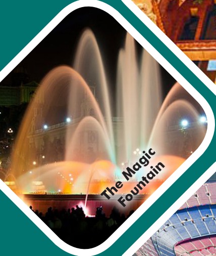
The Magic Fountain