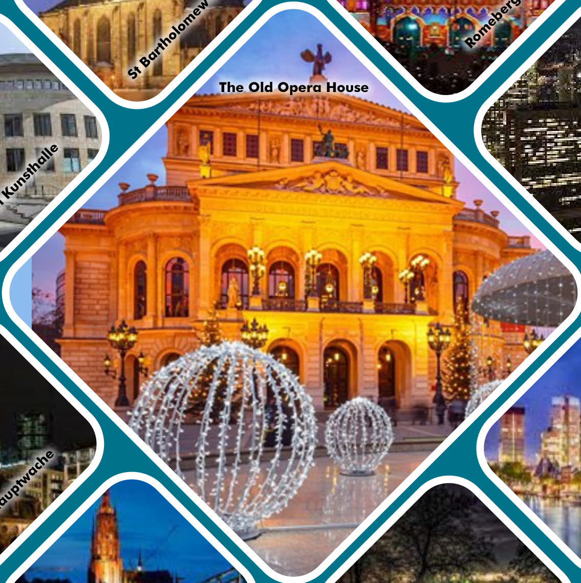
The Old Opera House