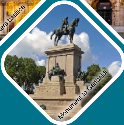
Monument to Garibaldi