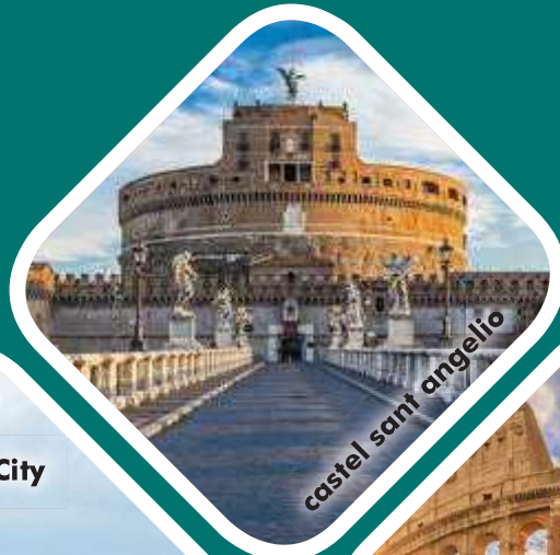
castel sant angelo