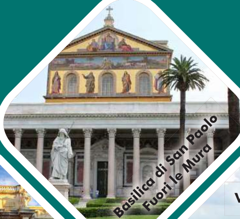
Basilica di San Paolo Fuori le Mura