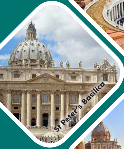
St Peter's Basilica