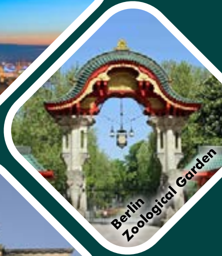
Berlin Zoological Garden