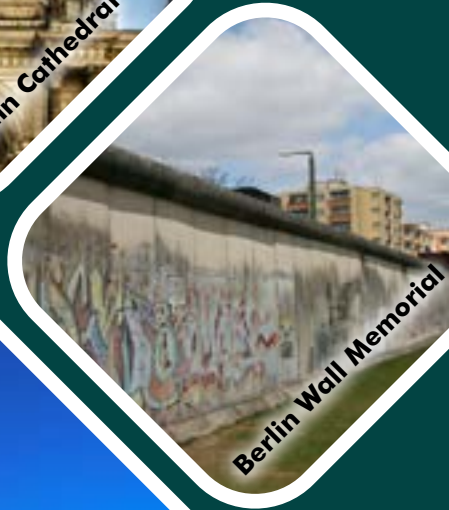
Berlin Wall Memorial