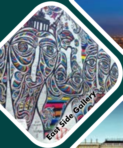
East Side Gallery