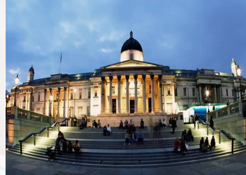
The National Gallery