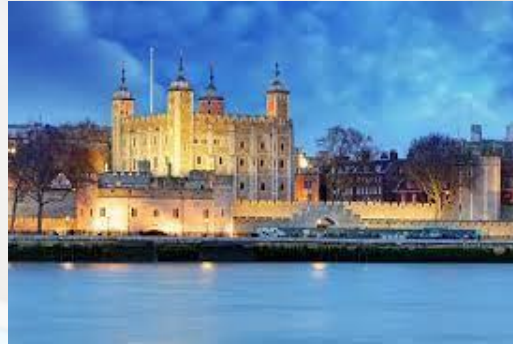
The British Museum