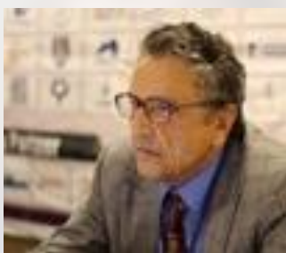
Claudio Nicolini Nanoworld Institute (Bergamo), Italy Italy