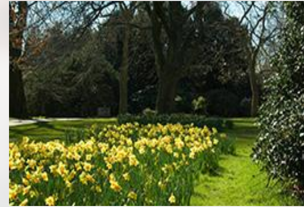
Royal Botanic Garden