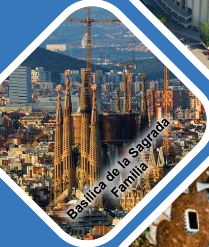
Basilica de la Sagrada Família