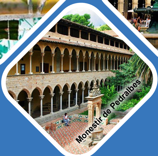
Monestir de Pedralbes