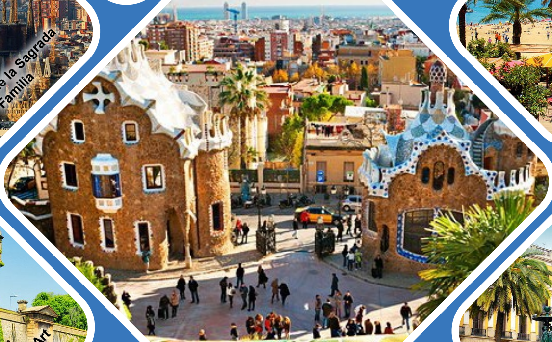
Gaudí's Surrealist Park