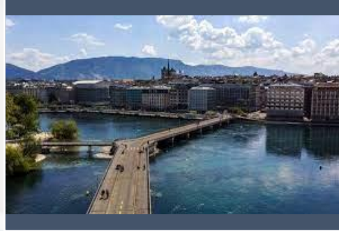
the World Federation