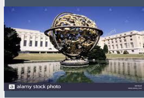
the Nations Palace