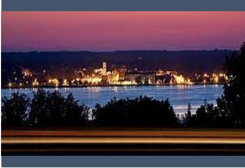
Geneva New York