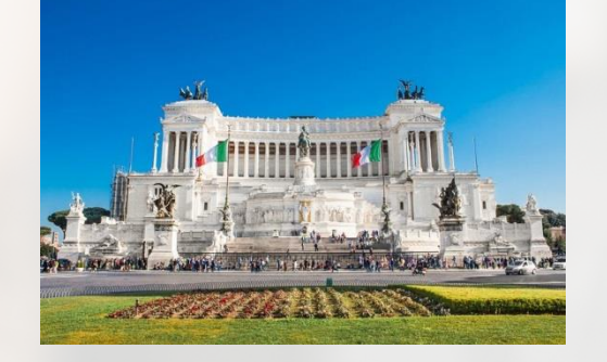
Vittorio Emanuele II Monument