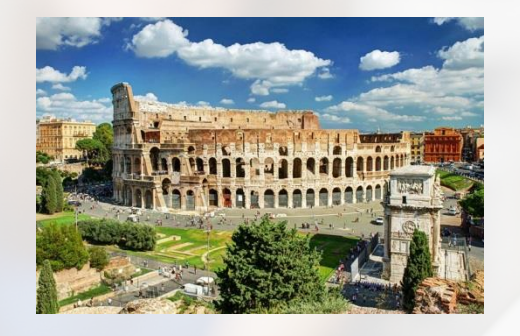
The Colosseum and the Arch of Constantine