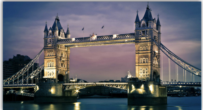
London Tower Bridge