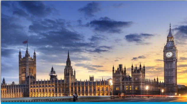
Big Ben Parliament