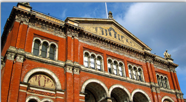
The Victoria and Albert Museum