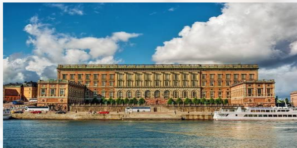
The Royal Palace