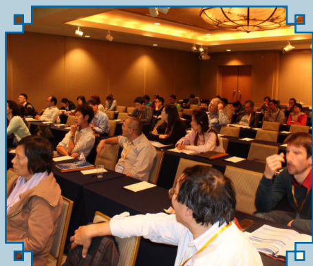
CONFERENCE HALL SPONSOR