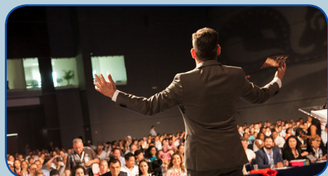
KEYNOTE FORUM SPONSOR