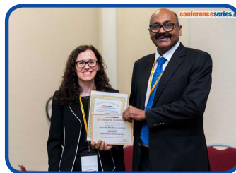
YRF AND BEST POSTER AWARD SPONSOR