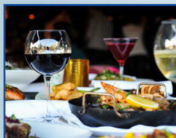
COCKTAIL AND PRE CONFERENCE DINNER SPONSOR