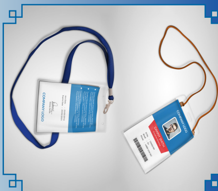
ID CARD SPONSOR