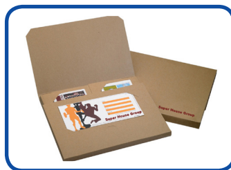
CONFERENCE KIT SPONSOR