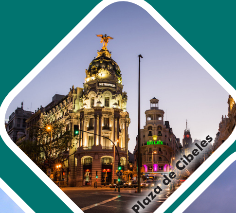
Plaza de Cibeles