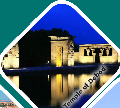
Temple of Debod