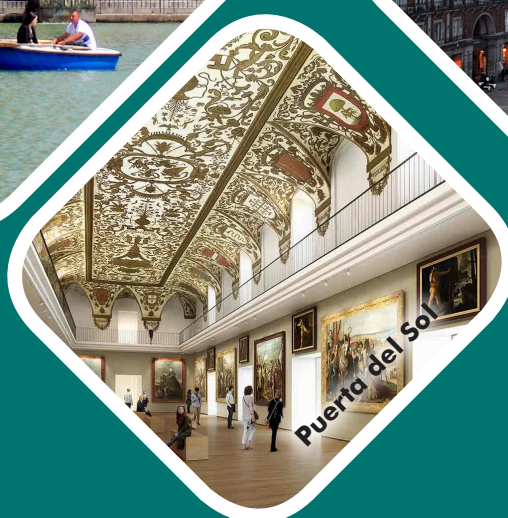
Puerta del Sol