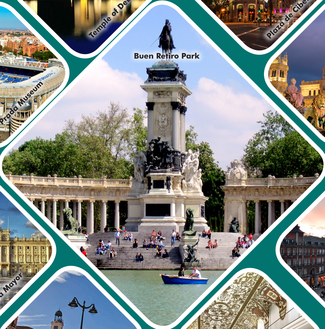
Buen Retiro Park