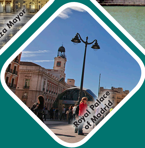
Royal Palace of Madrid