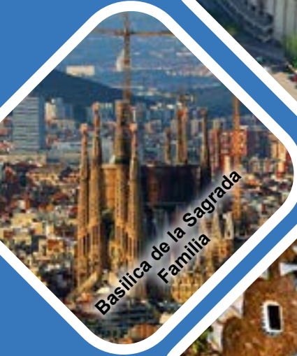
Basilica de la Sagrada Família