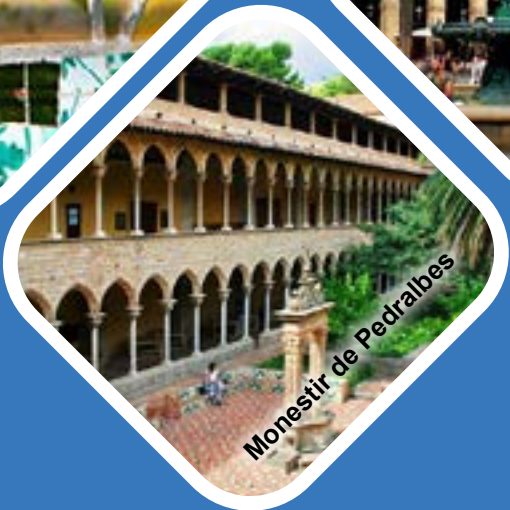
Monestir de Pedralbes