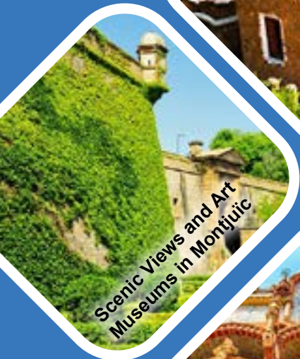
Scenic Views and Art Museums in Montjuïc