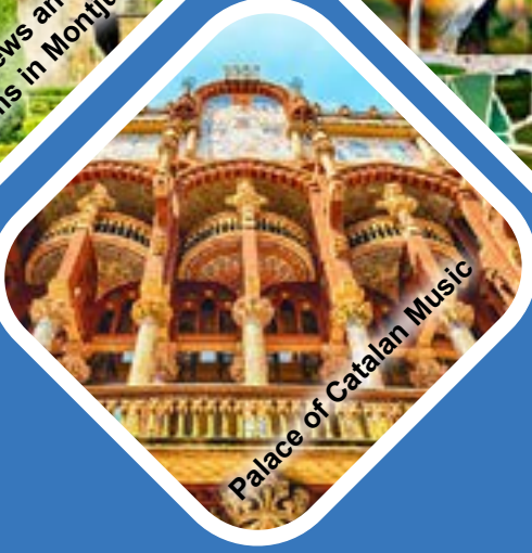
Palace of Catalan Music