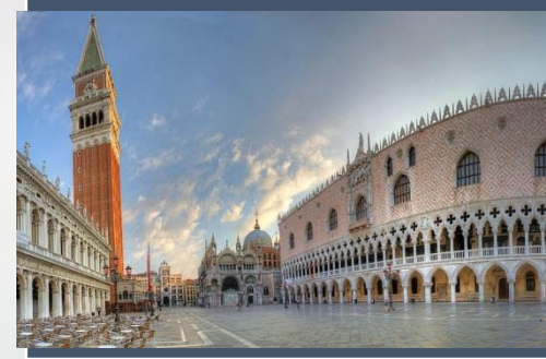
Piazza San Marco