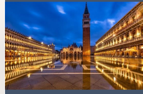
St. Mark's Campanile