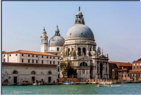
Basilica di Santa Maria