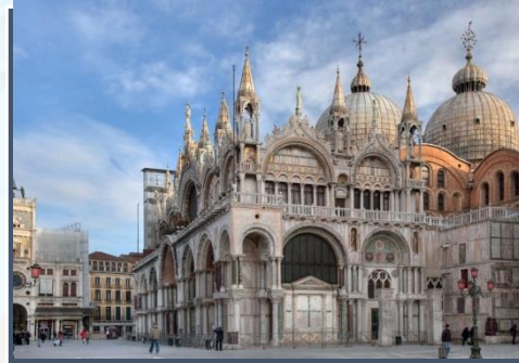
St. Mark's Basilica