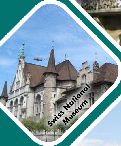
Swiss National Museum