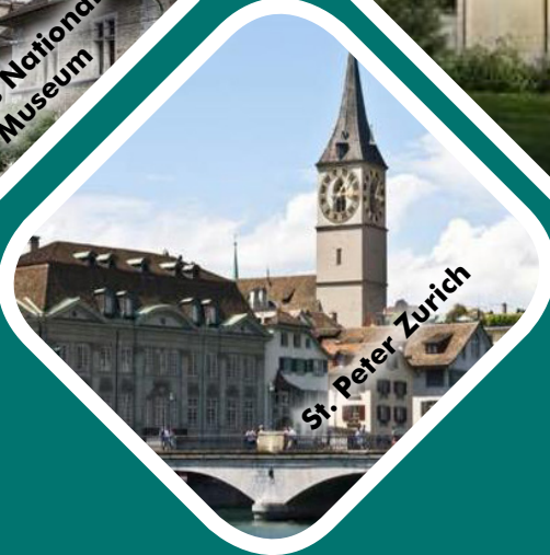
St. Peter Zurich