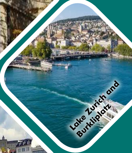
Lake Zurich and Burkliplatz