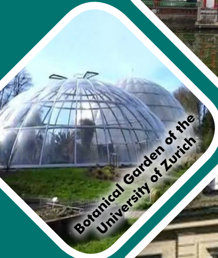
Botanical Garden of the University of Zurich