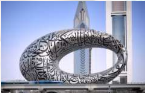
Museum of Future