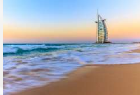
Burj Al Arab