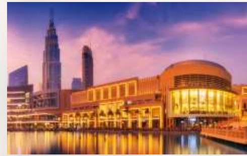
The Dubai Mall