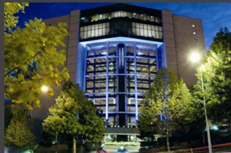
Site: Hilton Tokyo Narita

A coastal city, set amidst beautiful harbours, Auckland is a perfect blend of sophisticated city living and outdoor beauty that makes it one of the most desirable destinations in the world. This allows you to live where you choose – close to one of the beautiful north shore or eastern beaches, in the west near native bush, or in the city itself. The largest city in New Zealand and the world's biggest Polynesian centre, Auckland is a diverse mix of contemporary lifestyle, cultural heritage, sporting achievements, economic vibrancy and colourful multi-cultural uniqueness, set in pristine marine-based environment. Located in an 11 km-wide isthmus surrounded by the Pacific Ocean and Tasman Sea, the city enjoys a mild, sub-tropical climate and diverse landscape ranging from golden beaches, bush-clad hills, native forest and 50 beautiful Hauraki Gulf Islands. The city is liberally scattered with dormant or extinct volcanoes and if you climb to the top of any one of them, chances are, you will be able to pick out at least half a dozen others. One Tree Hill being one of the most famous. Rangitoto, guarding the entrance to the Waitemata Harbour, is the biggest and very hard to miss.