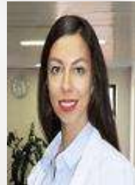
Ekaterina Naumova Eye Microsurgery Ekaterinburg Center Russia