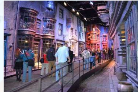
Warner Bros Studio Museum