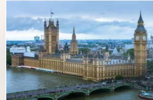
Palace of Westminster