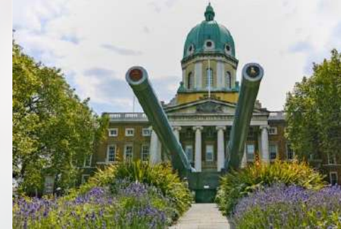
Imperial War Museum