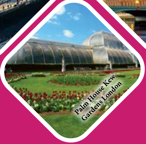
Palm House Kew Gardens London