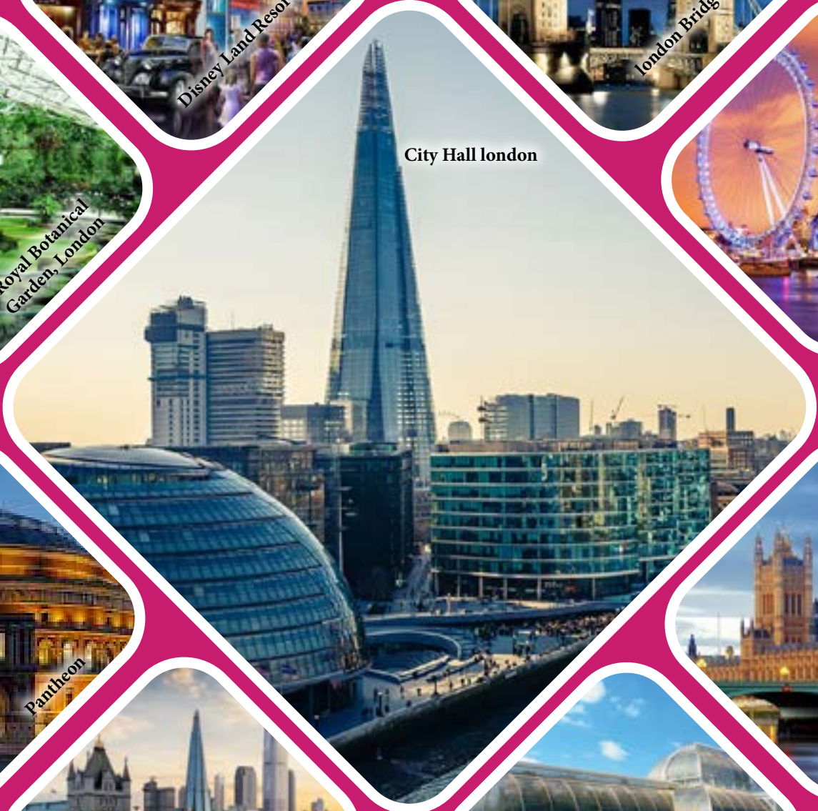
City Hall London