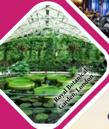
Royal Botanical Garden, London