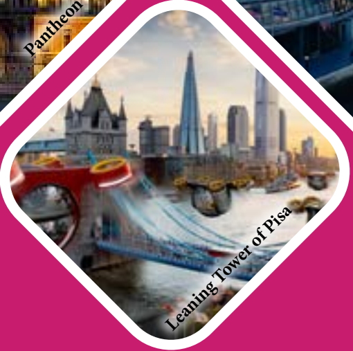
Leaning Tower of Pisa