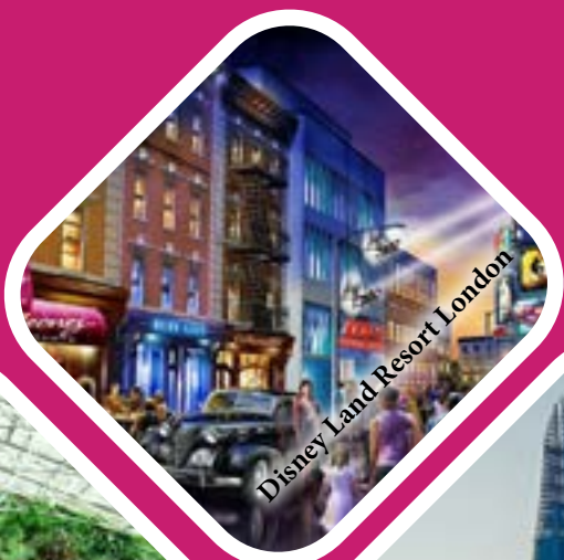
Disney Land Resort London