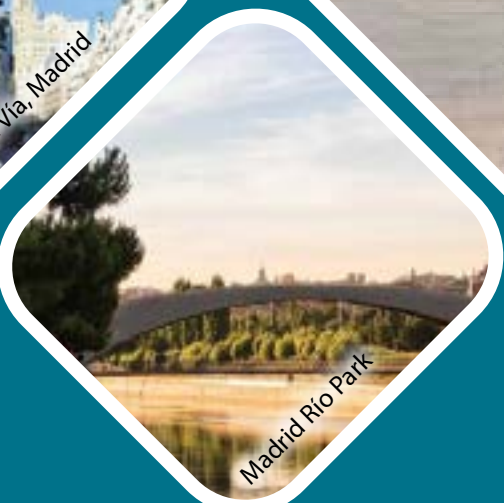
Madrid Río Park