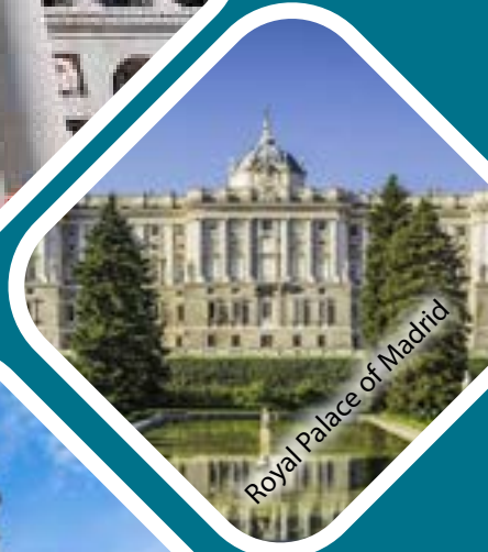
Royal Palace of Madrid