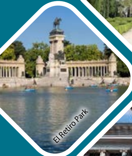
El Retiro Park