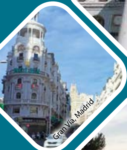
Gran Vía, Madrid