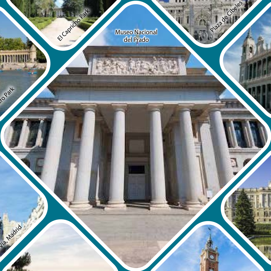
Museo Nacional del Prado