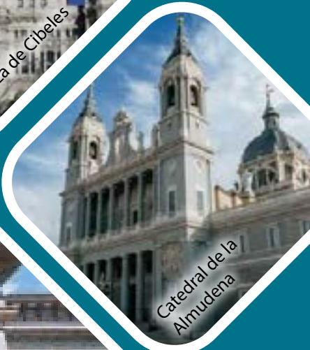
Catedral de la Almudena