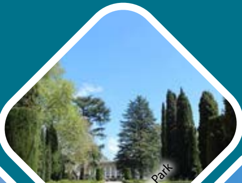
El Capricho Park