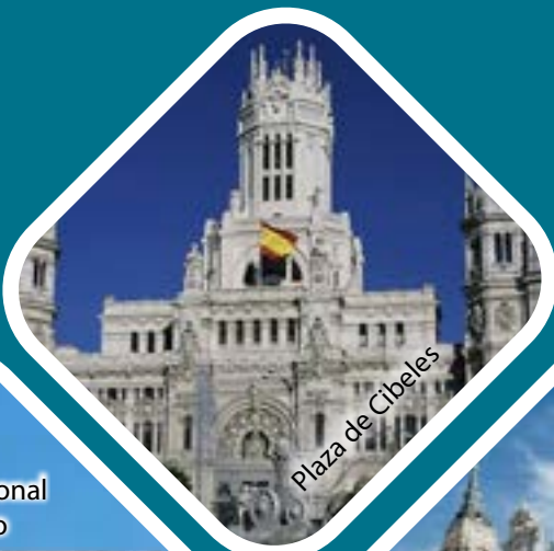
Plaza de Cibeles