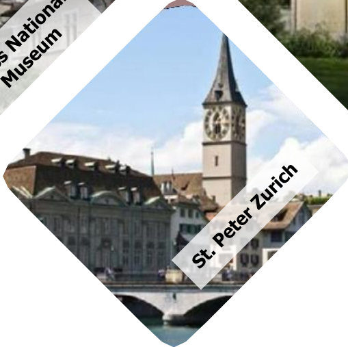
St. Peter Zurich