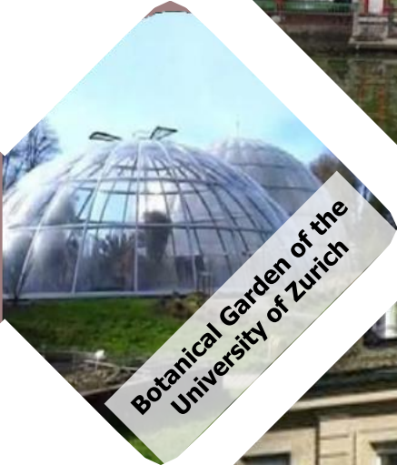
Botanical Garden of the University of Zurich