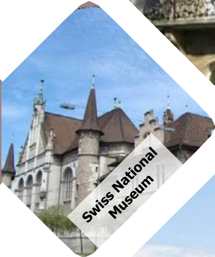
Swiss National Museum