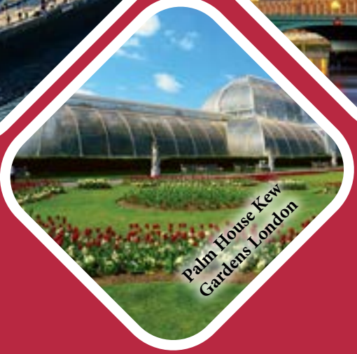
Palm House Kew Gardens London