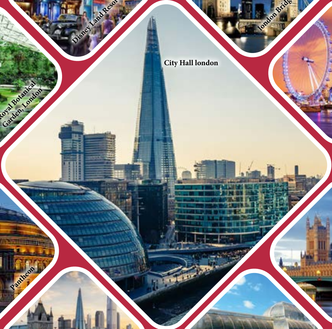
City Hall London