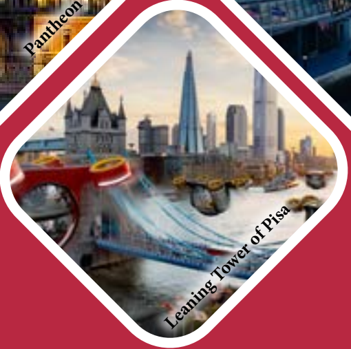
Leaning Tower of Pisa