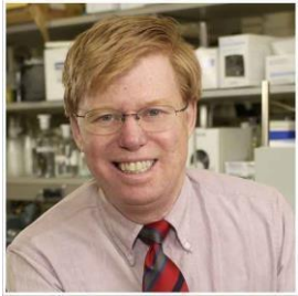
Moses Rodriguez College of Medicine Mayo Clinic, USA