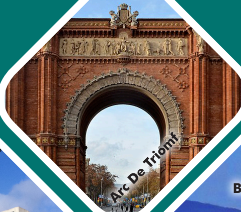
Arc De Triomf