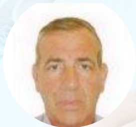
Arnon Edelstein Kaye Academic College of Education Israel