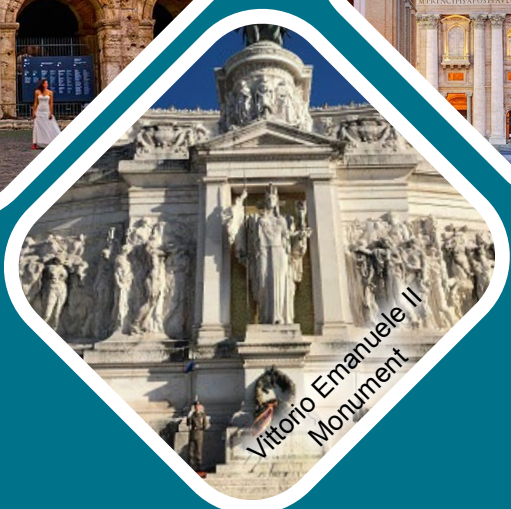
Vittorio Emanuele II Monument