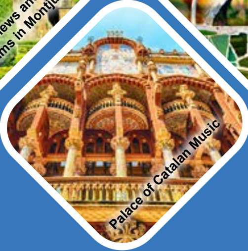
Palace of Catalan Music